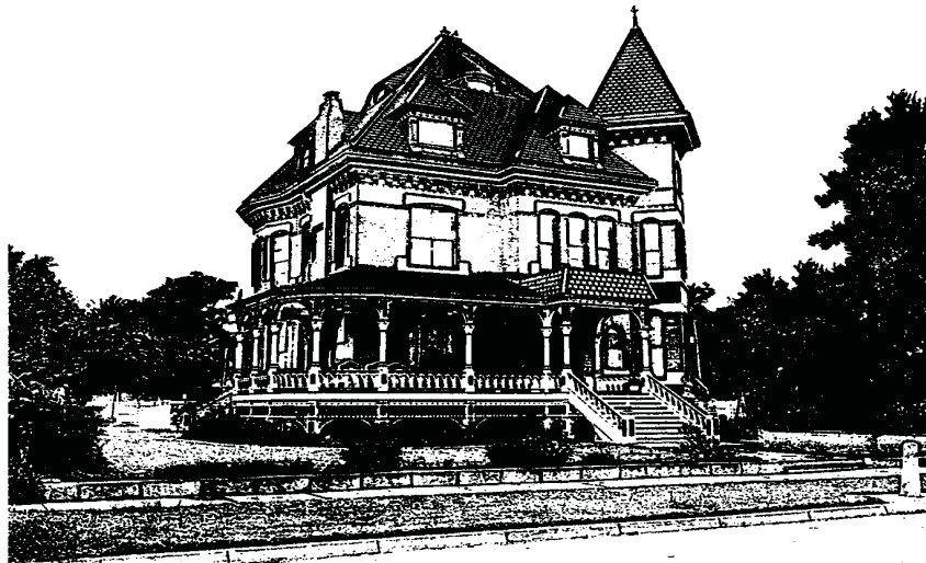
The Historic Pratt-Campbell Home at 1313 N. Emporia

Historic Midtown Citizens Association Presents its