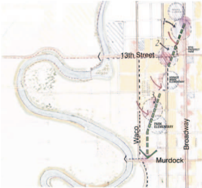
Construction on the Midtown Greenway is slated to begin in late 2007.

An exciting community development project called the Midtown Greenway began in 2002 when a group of active Midtowners wrote a grant application for federal transportation funding through the Kansas Department of Transportation (KDOT).