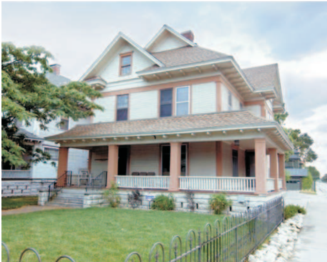
This stately home at 1359 N. Emporia will be open on this year's tour.

The 2006 Historic Midtown Walking Tour of homes is just around the corner...Saturday, October 14 and Sunday, October 15. Please see the flyer in this newsletter with more information.