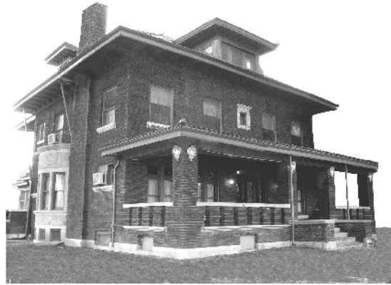
O. D. Barnes House 901 N. Broadway

Parking is plentiful, but please respect private property restrictions, especially for residents of the nearby apartments.